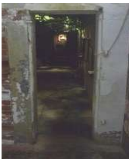
Convict ship exhibition