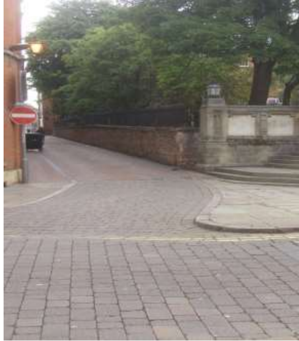
View from High Pavement, (close to Museum entrance)

Galleries of Justice Museum is to the right of the bottom of the hill.