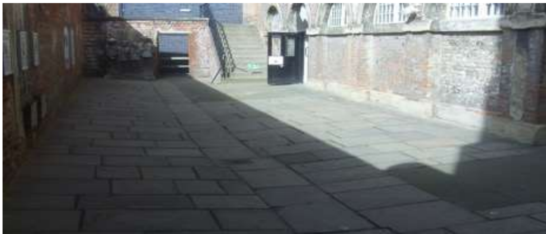
Main exercise yard at lower basement level