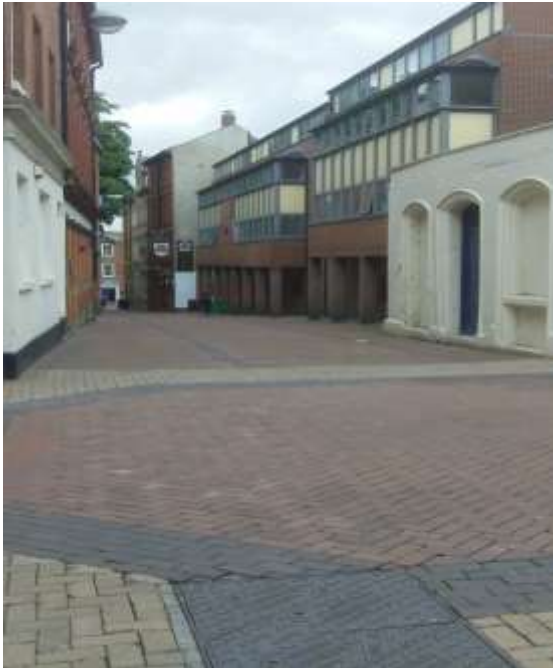
View to bottom of hill from Stoney Street car park exit / entry.

Galleries of Justice Museum is to the right of the bottom of the hill.