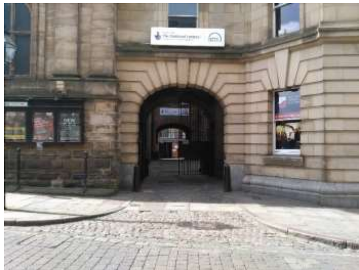
View from High Pavement showing tunnel entry to lift facility