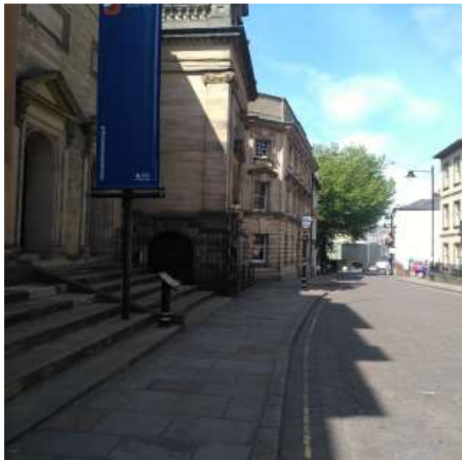
High Pavement approach road showing gradient and Nottingham Contemporary gallery. (Gold and green building)