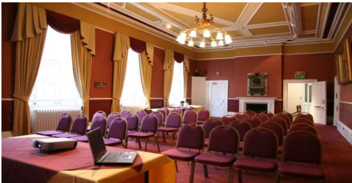
Grand Jury Room