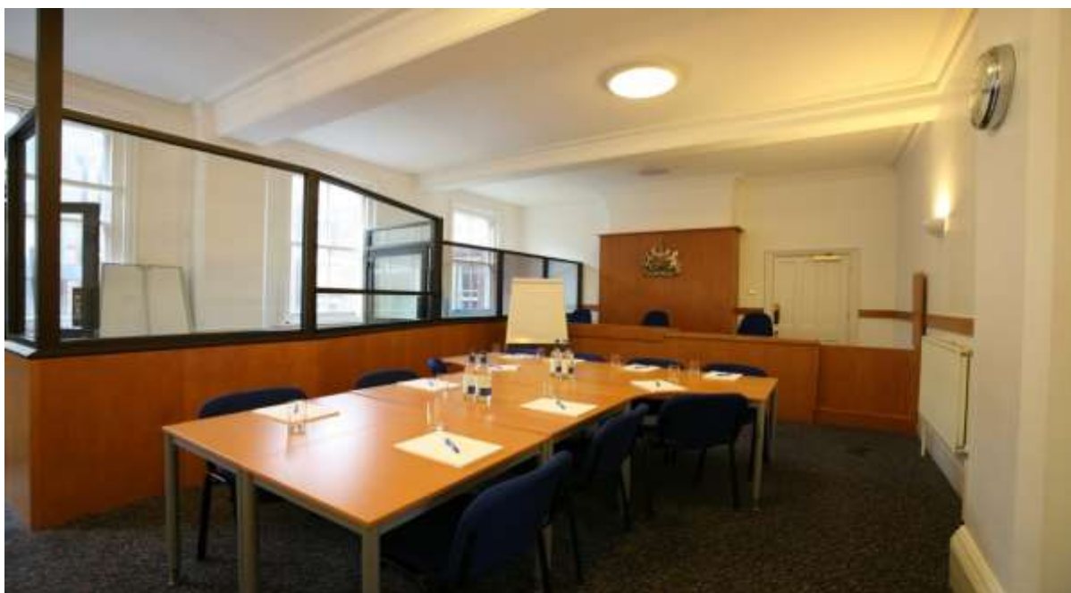
Youth Court meeting room