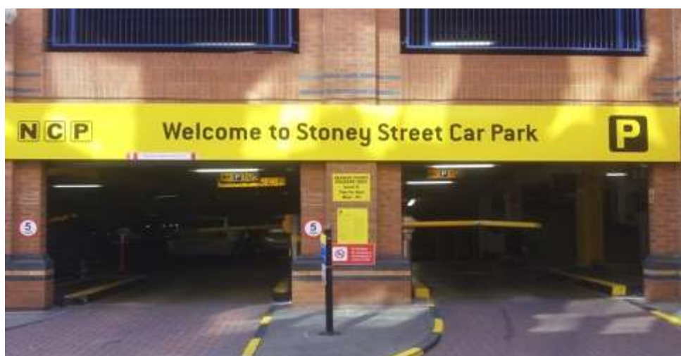
Entry to Stoney Street car park